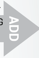
Fig: Placarding Screen